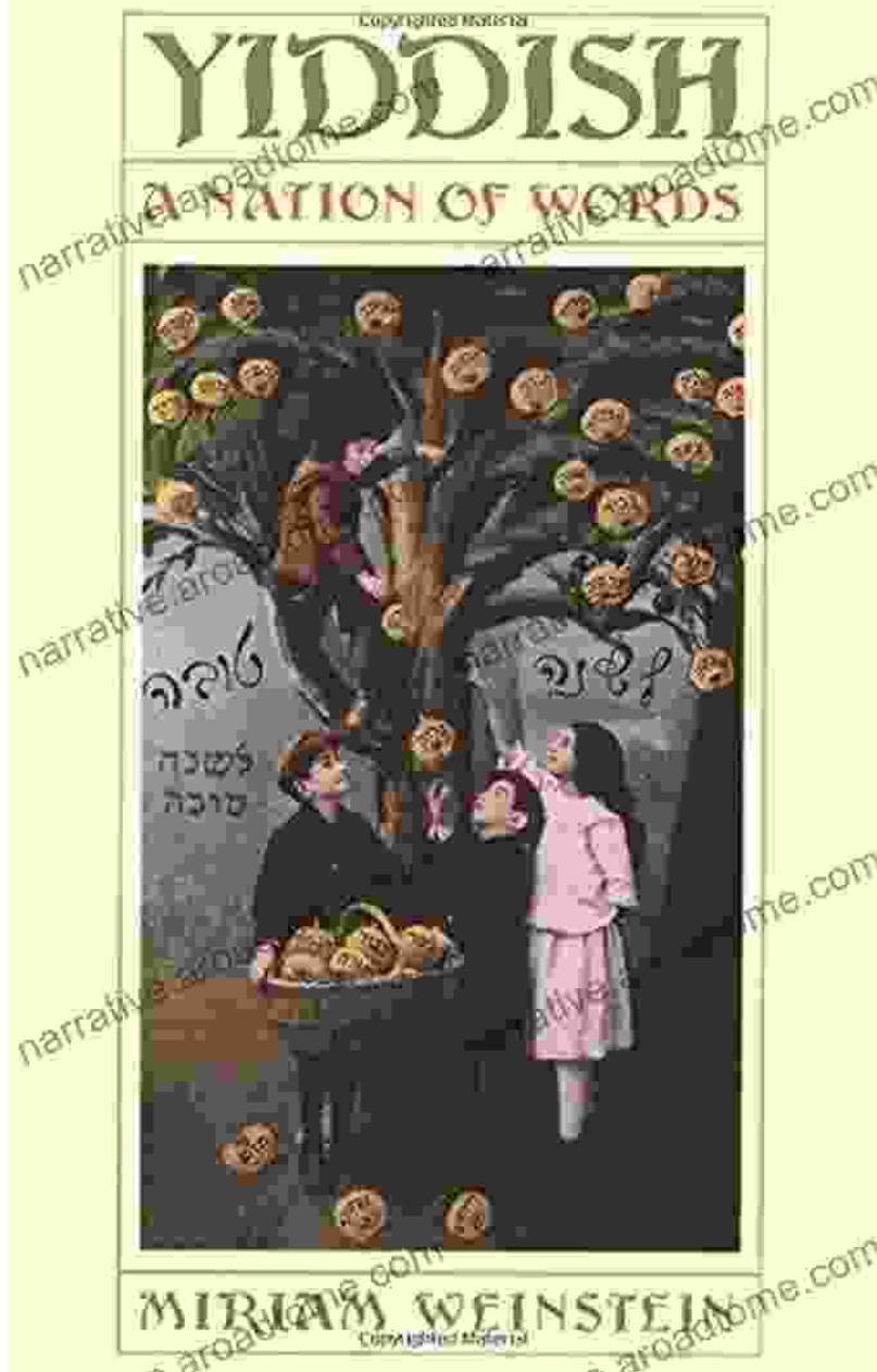
Yiddish Nation of Words cover. Copyright © 2023 by Dovid Katz. Used with permission.