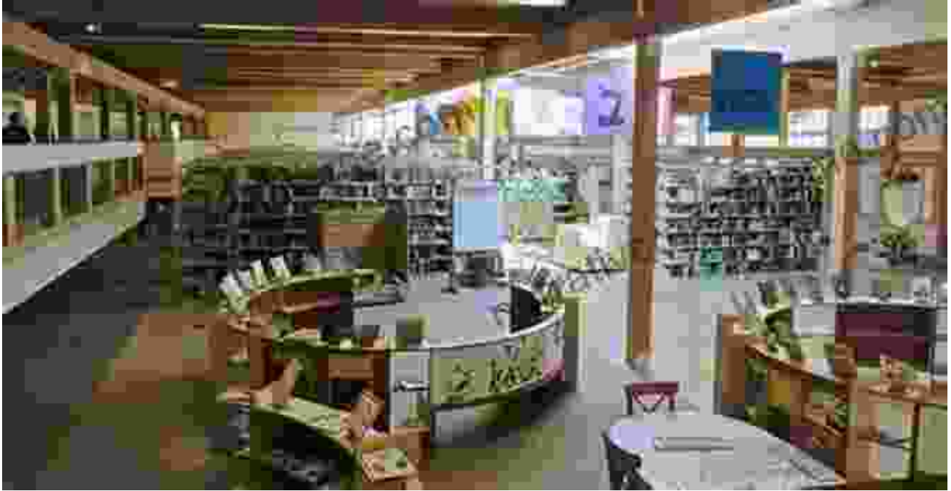
Yiddish Book Center in Amherst, Massachusetts.