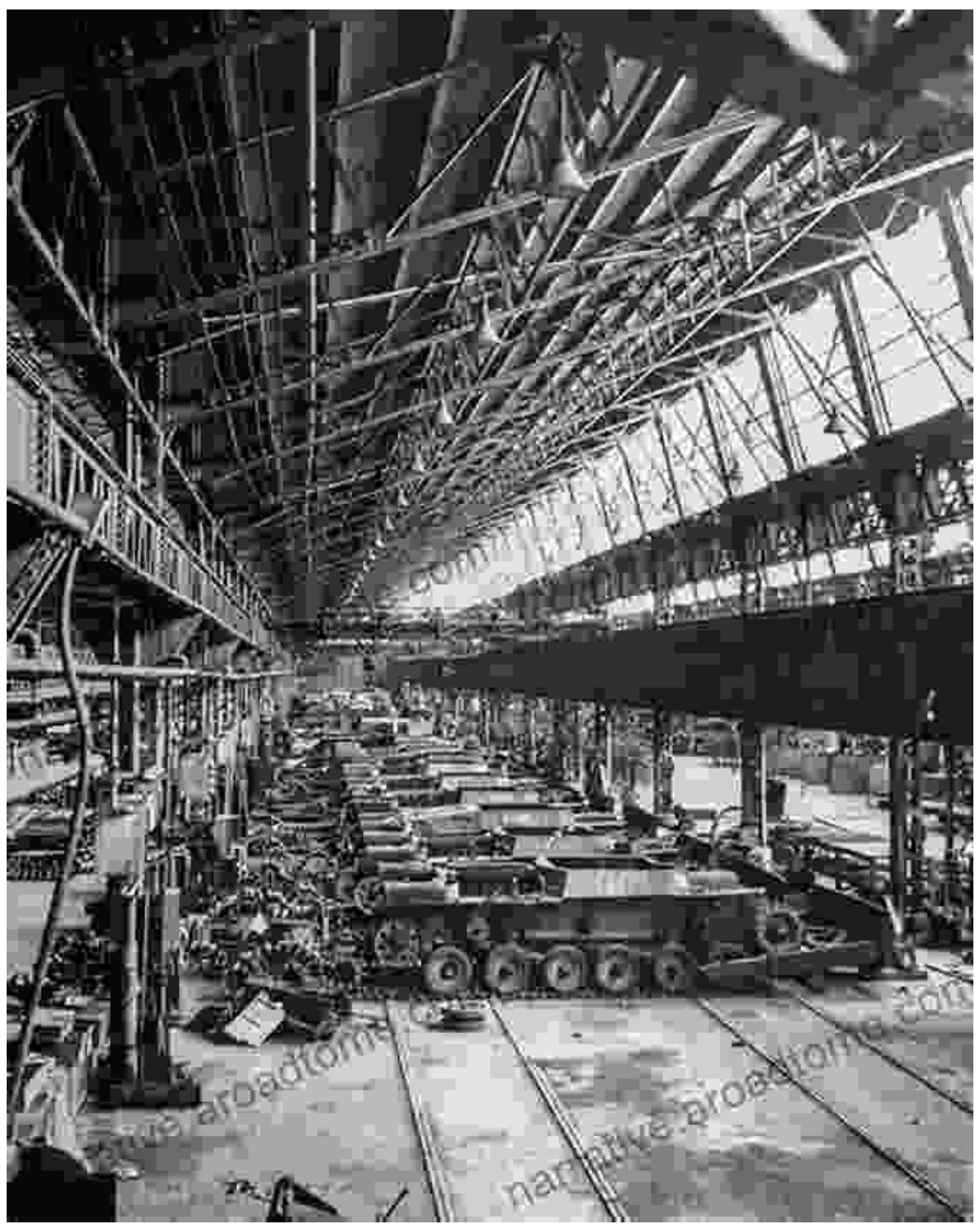
The Turán: A Versatile Workhorse

Among the most iconic Hungarian armoured fighting vehicles was the Turán medium tank. Combining speed, agility, and firepower, the Turán