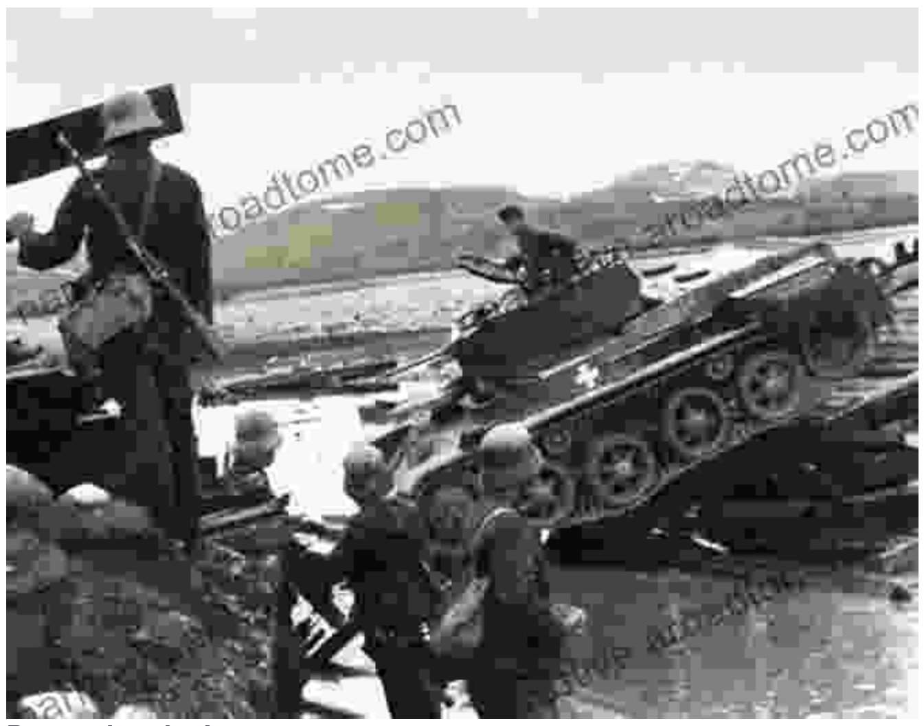
Preserving the Legacy

Today, a handful of Hungarian armoured fighting vehicles from the Second World War have been preserved in museums and private collections. These貴重な relics offer a tangible connection to the nation's military history and serve as a testament to the skill and ingenuity of Hungarian engineers. Visitors can marvel at their intricate designs, ponder their combat capabilities, and gain a deeper understanding of Hungary's role in the Second World War.