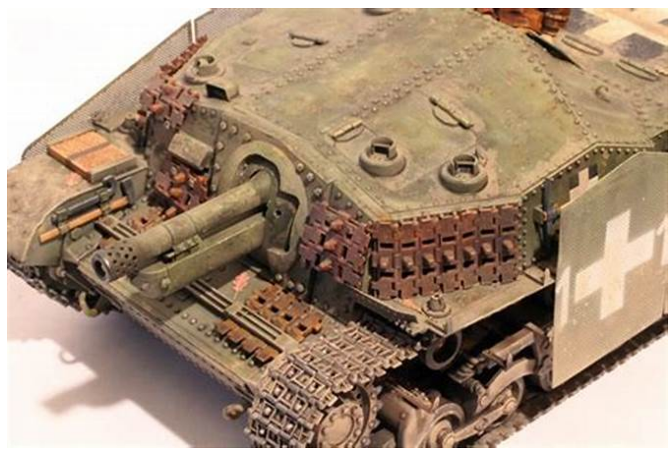
The Nimród: A Light Tank with a Punch

unleash devastating firepower upon enemy fortifications and armoured vehicles. Its well-sloped armour and low profile made it a challenging target for enemy fire, allowing it to operate effectively in urban environments and dense terrain.