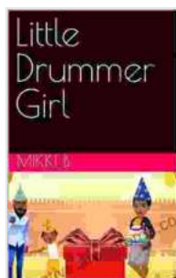
Image Alt Attribute: Cover of "Little Drummer Girl," featuring a young woman with a drum, against a backdrop of swirling colors and silhouettes.