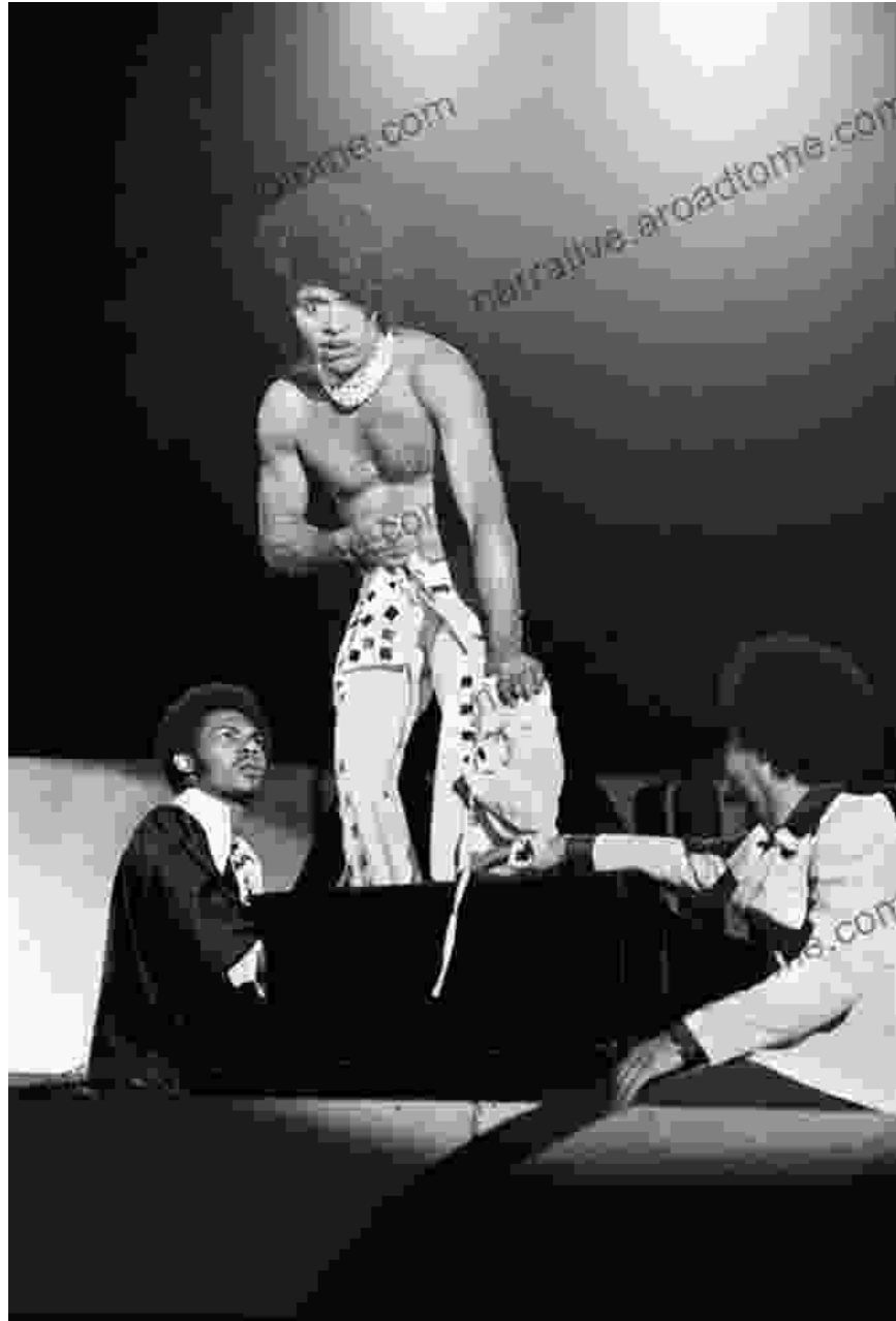
Little Richard, the Architect of Rock and Roll

Another American artist who had a profound impact on the British Invasion was Little Richard. Richard's flamboyant stage presence, powerful vocals, and driving piano playing made him a true rock and roll pioneer.